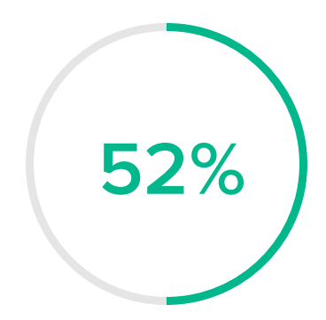
52% Of consumers are likely to switch brands if a company doesn't make an effort to personalize communications to them.

Applause helps retailers validate their content, personalization, and localization efforts by providing real-world testers in-market that speak the languages retailers are trying to reach. And since these real-world testers are made up of real customers in retailers' target demographics, they are able to provide the necessary feedback on how effective personalization and content is in moving them through the buying process, allowing them to adjust their strategies accordingly to best fit their customers' needs.